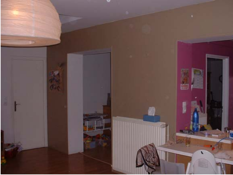
Photo : en marron le mur a supprimer