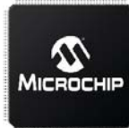
144-lead LQFP (PL) 20 x 20 x 1.4 mm