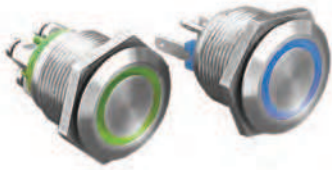
MPI002- front panel seal to IP66