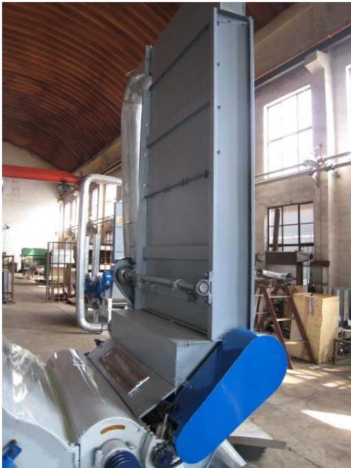
Chute feeder HP-F08