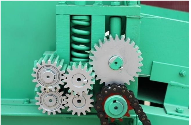
HP-R404 four rollers cleaning machine