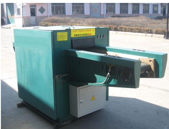
HP-LC35 Cutting machine